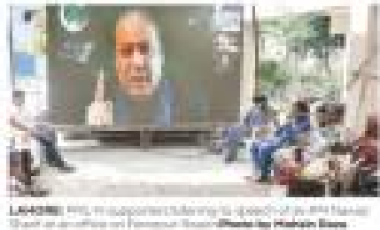
LAHORE: PML-N supports challenge to speech of prime minister Sharif in a hall of Parliament House.

HEALTHY BLOOD HEALTHY BLOOD HEALTHY BLOOD