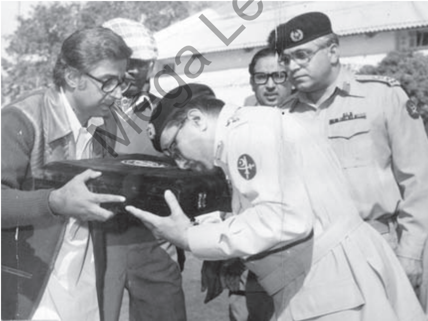
General Zia-ul-Haq receiving a rare copy of the Quran, Hyderabad, 1979.

A sprightlier and more confident Zia had been hard at work to secure a prolonged and productive spell of military rule in Pakistan. In pursuit of his stated aim to create a morally upright nation of Muslims, General Zia-ul-Haq on February 7, 1979, introduced a constitutional amendment through a presidential order giving the high courts jurisdiction to establish Shariat Benches to determine whether a law was repugnant to Islam. Taking a first step toward “Islamization,” Zia presented this as the fulfillment of the people’s demand. He was misinterpreting the popular will. What people wanted was a system based on social justice and equity, regardless of whether it was called socialist or Islamic. Exposing the politically motivated nature of his “Islamization” policies, Zia avoided taking the perilous course of trying to recast the economy in the light of Islamic principles of egalitarianism. While undertaking to introduce interest-free banking, the focus was on imposing prohibitive or punitive laws that gave differential weight to the testimony of Muslims, non-Muslims, and Muslim women. Discrimination on the basis of religion and gender made a mockery of justice.