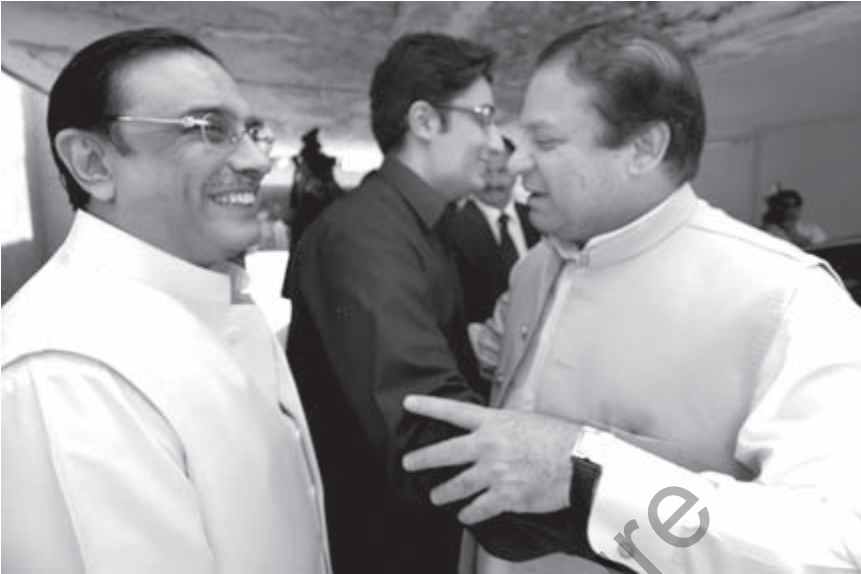
Nawaz Sharif being welcomed at Zardari House in Islamabad by Bilawal Bhutto Zardari and Asif Zardari.

in cases involving terror suspects had piqued not only the ISI but also the Americans. After detailed briefings by the military, the PPP-led coalition in a major policy decision took political ownership of military operations against insurgent strongholds in both FATA and the settled areas of the NWFP. This exposed the government to charges of fighting America's war against its own people. Apprehensive of American policies in Afghanistan, the PML-N leadership had to be persuaded to support the operations in FATA. Contrary to its reassurances to the PML-N, the PPP began dragging its feet on the restoration of the judges. The reason was all too apparent. Reinstating Justice Iftikhar Chaudhry threatened to scuttle the NRO, dubbed the "greatest laundering and dry-cleaning act known to the sub-continent." 8 In mid-May, Nawaz Sharif used the nonimplementation of the judges' restoration to withdraw his ministers from the cabinet. Needing the PPP's numbers in Parliament to turf Musharraf out of office, the PML-N leader announced his party's continuing support for the government.