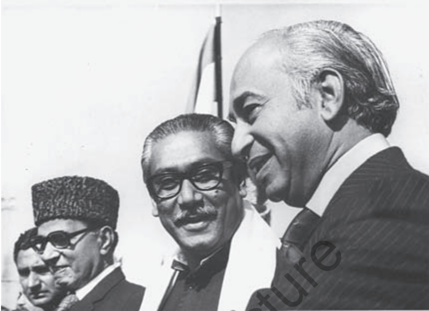
Zulfikar Ali Bhutto with Mujibur Rahman at Lahore Airport, February 23, 1974.

public rallies for their greed and exploitation. The reversal of commitments put off the PPP's left-wing constituency, dampening the spirit of party workers just when the land and labor reforms were generating enthusiasm for the PPP. It was the classic quandary of a populist politician who had successfully made his way to the apex of state power by playing to all factions within his party.