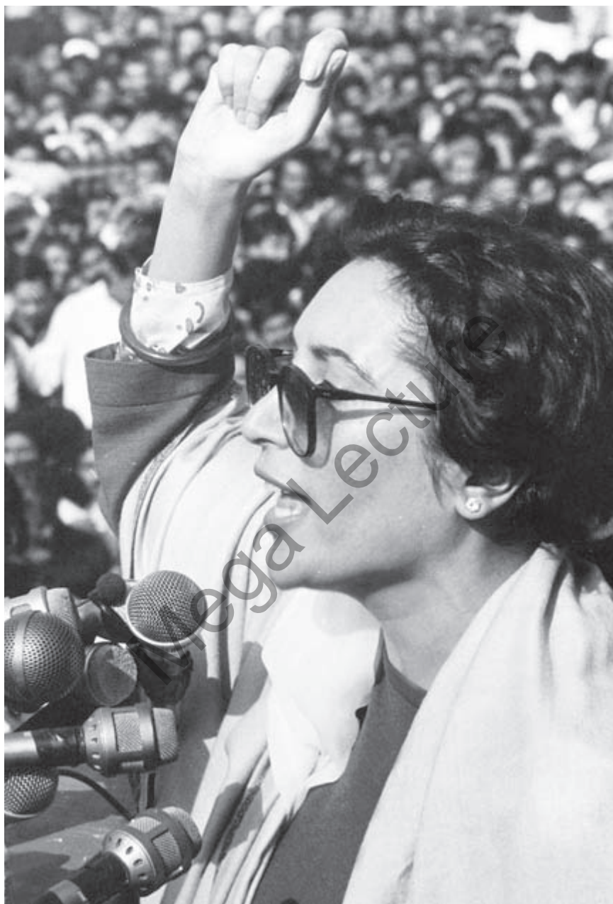
Benazir Bhutto at a public rally in Lahore.