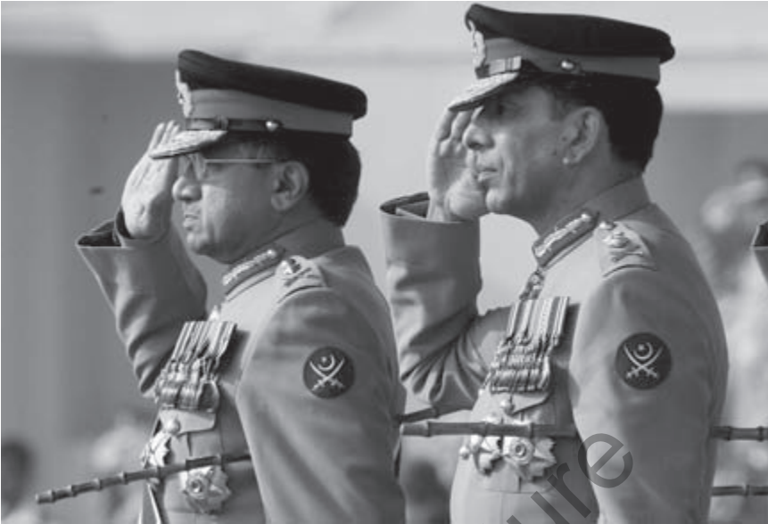
Change of command: Generals Musharraf and Kayani.

the regime meshed uneasily with fears about their security. On December 27, with the country in the heat of the election campaign, Benazir was killed in a suicide bomb attack after inveighing against extremism at a PPP rally in Rawalpindi. Vital evidence was lost once the police suspiciously washed down the assassination scene. In another critical lapse, no autopsy was carried out, with the result that Benazir's death has remained a subject of open speculation. Members of her family, who saw the corpse, maintained that she had been shot in the neck, contradicting the government claim that the death occurred as a result of her head hitting the handle of the vehicle's sunroof. Others believed she had perished in the bomb explosion that killed twenty others.