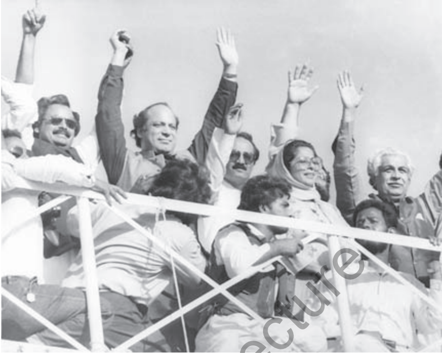
Muhajir Qaumi Movement–Pakistan Muslim League (Nawaz) alliance, Altaf Hussain with Nawaz Sharif, Begum Abida Hussain, and Ghulam Mustapha Jatoi at a public meeting in Karachi, December 1988.

cade. The American decision was presented to the electorate by the IJI as evidence of Benazir's Zionist connections.