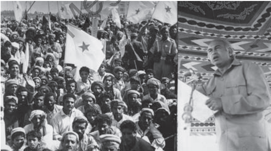
Zulfikar Ali Bhutto: The populist.

These noble words were fraught with irony. While inveighing against the previous regime for feeding lies to the people, Bhutto was unwilling to concede the bitter reality of military defeat or the obvious fact that East Pakistan was now the independent state of Bangladesh. Long after the signatures on the surrender document had dried, he insisted that the eastern wing remained “an inseparable and indissoluble part of Pakistan.” “We have not lost a war,” Bhutto stated disingenuously, “we have not failed.” The “gallant armed forces” and the people of Pakistan had nothing to be ashamed of. Bhutto pledged to stick by the people through thick and thin and to never deceive or betray them. All he asked in return was their cooperation. With the people’s cooperation, he could “look over the Himalayas”; without them he was “simply nobody.” Ending on an uplifting note, Bhutto proclaimed Pakistan as the crystallization of a great ideal that was imperishable. Pakistanis would see to it that the stigma of defeat at India’s hands was wiped out and national honor fully vindicated, “even if it has to be done by our children’s children.” 3