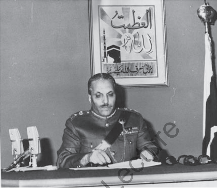
General Zia-ul-Haq addressing the nation.

ers were said to have met Carlos the Jackal, the notorious Venezuelan considered to be the kingpin of international terrorism at the time. The thirteen-day drama ended with the regime releasing fifty-four political prisoners, paying $50,000 to the hijackers, and letting them seek asylum in Libya. Less than twenty-four hours after the hostages were set free in Damascus, Zia went on radio and television to denounce the hijacking as an anti-Pakistan conspiracy by “unpatriotic politicians and a foreign government.” It was designed to punish Pakistan for standing in the way of another nation’s “foreign designs,” a reference to the fifteen-month Soviet occupation of Afghanistan. Charging the PPP leadership of collusion with the Soviets and the Afghan government, Zia intended to wreak maximum political damage. The “snakes in the sleeve” inside the country belonged to a group that believed in the “politics of violence” and opposed Pakistan’s ideology. 26