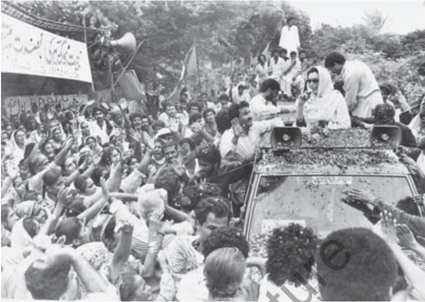
Benazir Bhutto campaigning in Malir, Karachi.

and green PPP flags. 2 Bibi, as she was known in popular parlance, “gives off white heat,” a fervent supporter remarked. 3 Using her party’s catchphrase “bread, clothing, shelter,” Benazir promised to raise wages for workers and give land to the tiller in keeping with her father’s principle of “Islamic socialism,” adding her own charged slogan: “Martyrdom is our cause.”