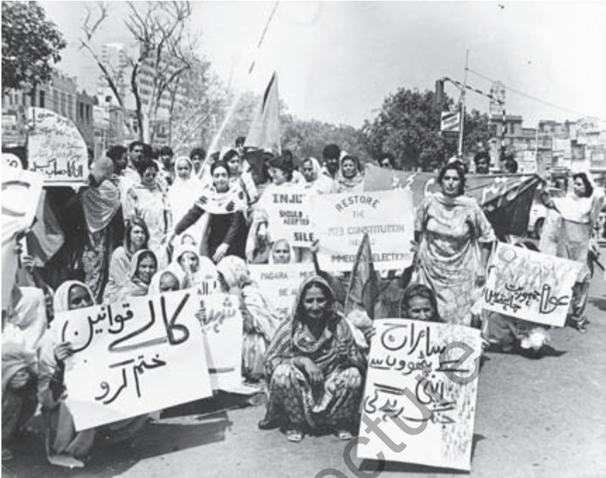
Women protesting against the Zia regime in Lahore.

With sections of the ulema willing to approve Zia's equation of his regime with the introduction of an Islamic system of government, the liberal intelligentsia was left fighting a losing battle. While resistance assumed multiple forms, urban and middle-class women led the street protests against Zia's so-called Islamization policies. The stimulus came from a law that reduced a woman's evidence in certain commercial cases to half that of a man's. Zia's law of evidence stirred an elementary uprising among educated, urban, upper-class women that found strong support among many men. As enraged women organized the Women's Action Forum (WAF) and took on the baton-wielding arms of the state, they were beaten and hurled into jail. Saeeda Gazdar's inspirational poem "Twelfth February, 1983" immortalized the moment: