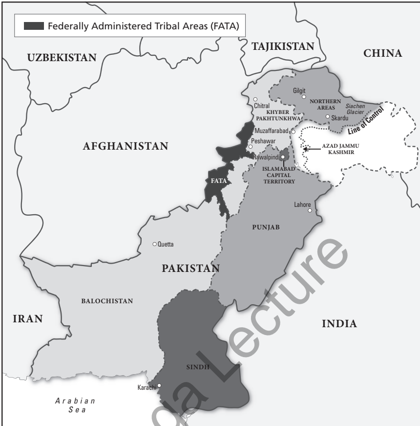
Map of Pakistan, post-1971. Azad Jammu and Kashmir are to the left of the Line of Control.

minister was also removed. Seen as restoring Pakistan's long-suffering parliamentary form of government, these provisions were welcomed by a cross section of political opinion. But there were contentious ones as well including the new method of appointing judges through a judicial commission and changing the name of the NWFP to Khyber Pakhtunkhwa (KPK) in response to the ANP's long-standing demand. Skillful negotiations and tactical compromises averted a derailment of the agreement between the PPP, the PML-N, and the ANP. A few days later, Zardari signed the Eighteenth Amendment, becoming the first president in Pakistan's history to voluntarily reduce his powers in the interest of strengthening both parliamentary democracy and the federation.