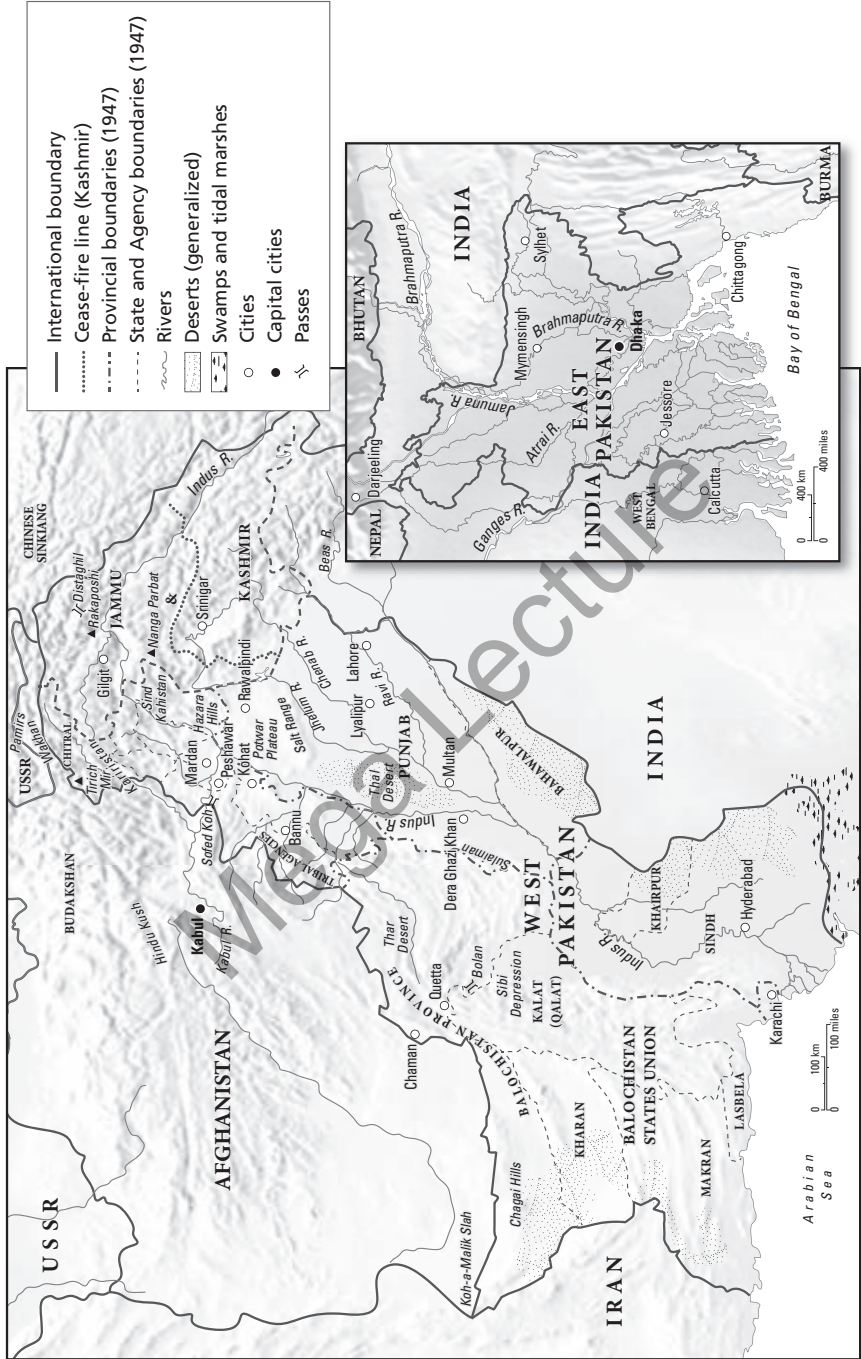
Map of Pakistan, 1947.