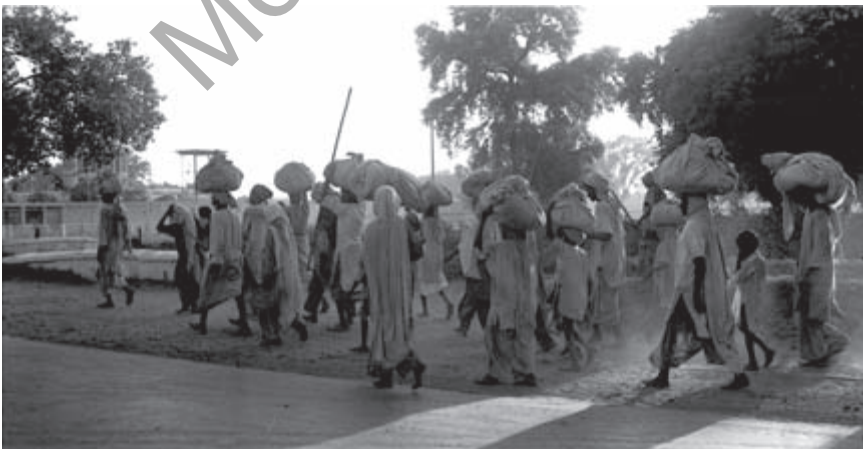
Refugees.

The Urdu short story writer Saadat Hasan Manto, who lived through the cataclysmic events of 1947, has left a riveting account of the psychodrama of partition as it played out in the lives of ordinary people. A witness to the troubled times, Manto kept his ears close to the ground, making his literary corpus a treasure trove for historians looking for insights into the human dimension of partition. What he saw of the batwara , the vernacular term he used to refer to partition, convinced him that it was not religious zealotry or piety but human greed and man's astonishing capacity for bestiality that had brought the subcontinent to such a sorry pass. A social renegade who mostly wrote on ethically challenging issues through a probing exploration of human psychology, Manto was a humanist who could not suffer bigots. In his irreverent self-epitaph, Manto wondered whether he was a greater short-story writer than God. In story after story, he captures the snapping of old bonds of friendship and the melting away of love and shared cultures in a milieu infected with the rhetoric of "Muslim" and "Hindu" animosity. He left the politics of the murderous frenzy that soaked the subcontinent in blood at the moment of the British withdrawal to latter-day historians. His forte lay in cutting through the communitarian morass of the period to lay bare the ugly but