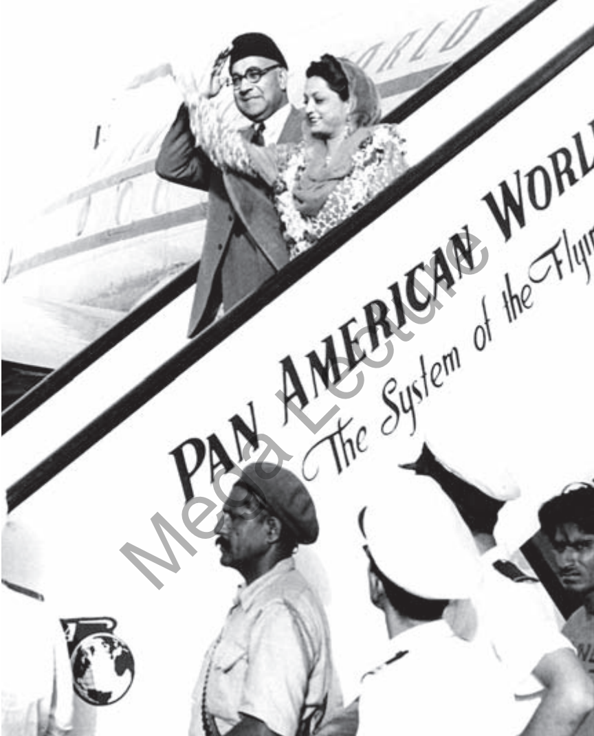
Liaquat Ali Khan and Mrs. Rana Liaquat Ali Khan.