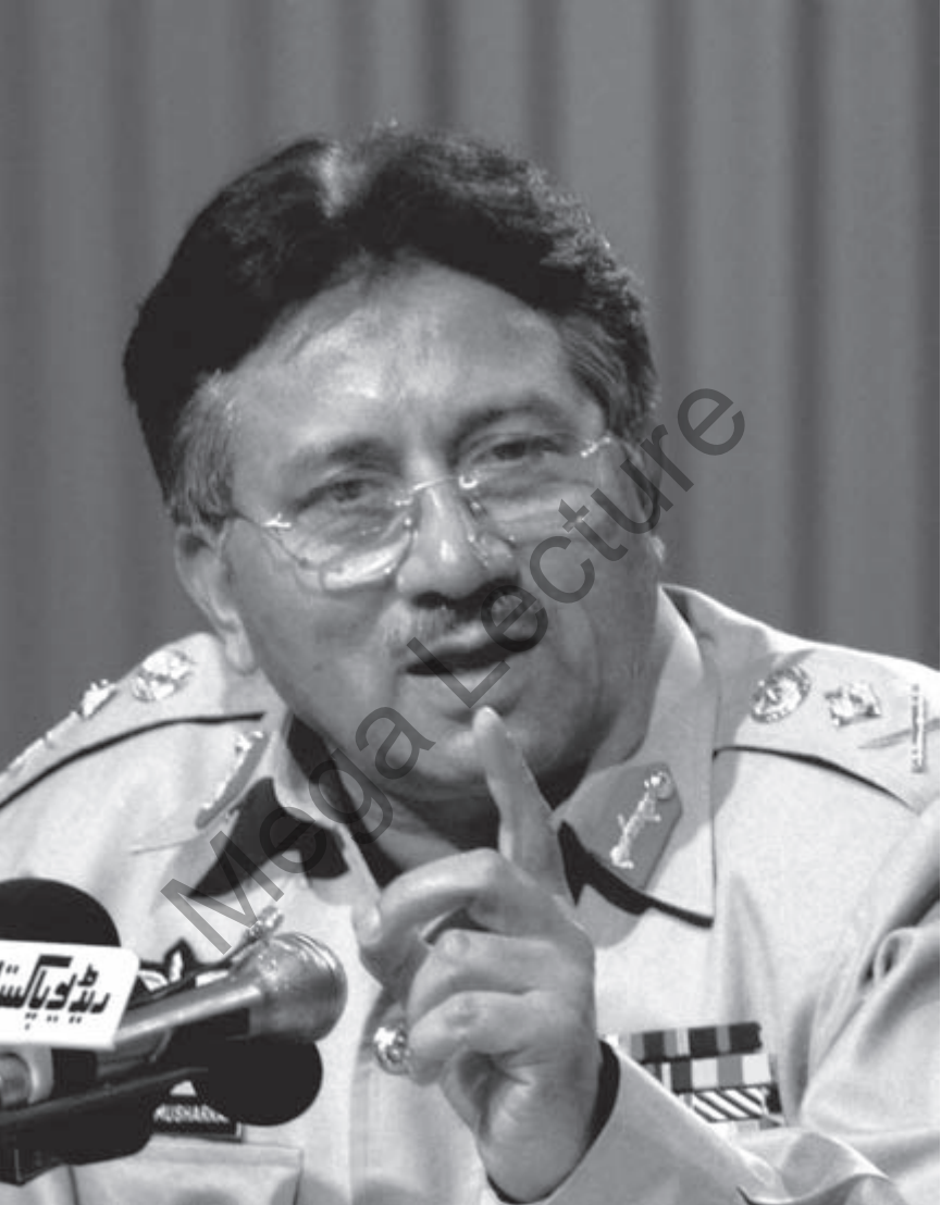
General Pervez Musharraf.