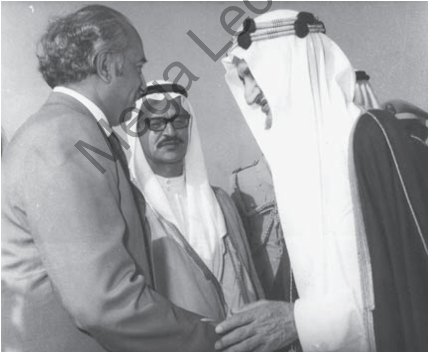
King Faisal greeting Zulfikar Ali Bhutto at Hamar Palace, Jeddah.