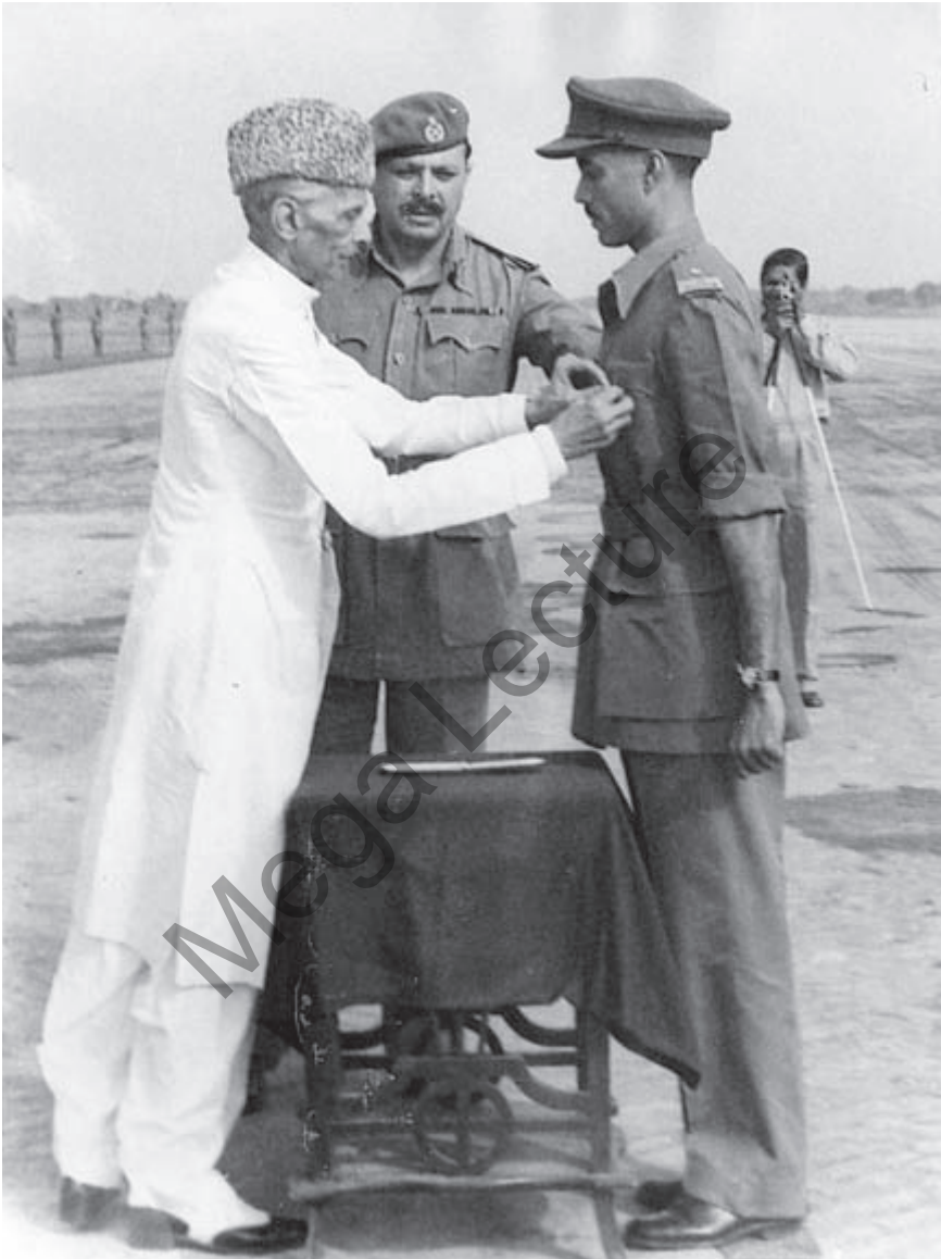
Jinnah decorating an army officer at Dhaka during his visit to East Pakistan in March 1948 with General Commanding Officer Ayub Khan looking on.