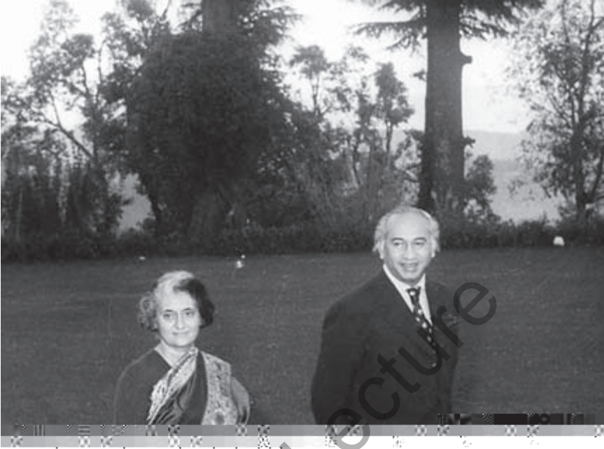
Indira Gandhi and Zulfikar Ali Bhutto on the lawns of Raj Bhawan, Simla, June 30, 1972.