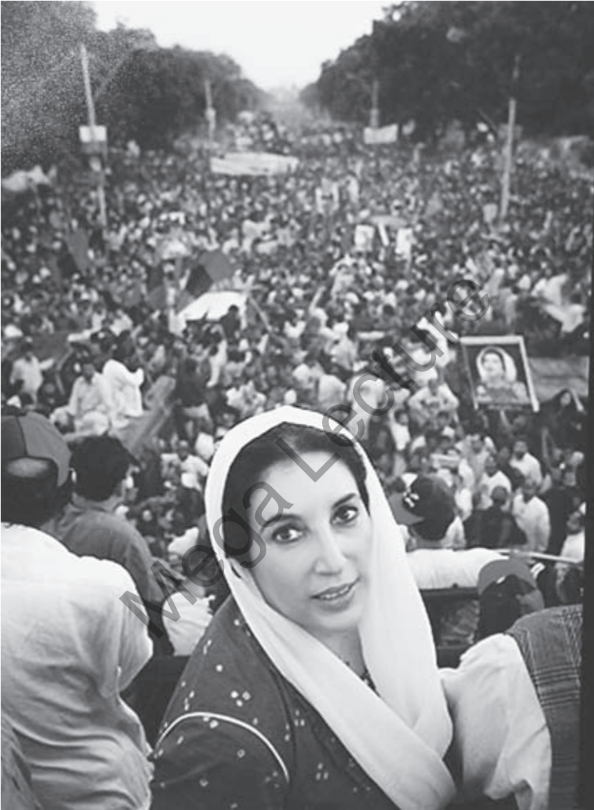
Benazir Bhutto on her arrival in Karachi on October 18, 2007.