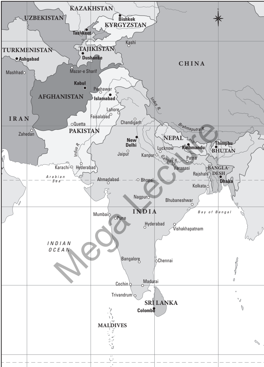
Map of South Asia, post-1971.