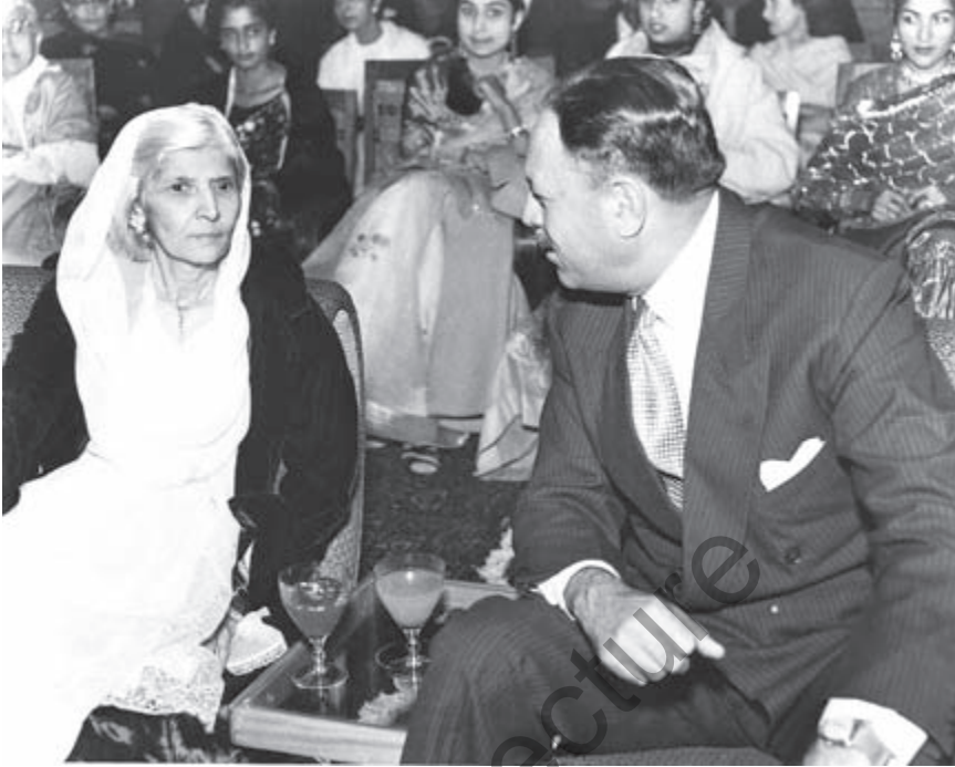
Ayub Khan with Fatima Jinnah at a reception on January 16, 1959.

with her good showing in East Pakistan and Karachi, the commercial hub of Pakistan. When the results of the January 2, 1965, elections were counted, Ayub had won a comfortable majority, bagging 49,951 votes against his opponent's 28,691. Dismissing the election as a farce, Fatima Jinnah portentously stated that "the so-called victory of Mr. Ayub Khan" would turn out to be "his greatest defeat." 27