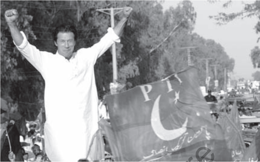
Imran Khan leading an anti-US drone “peace caravan” to South Waziristan, October 7, 2012.

quintessential antipolitician hero in the improbable role of politician. His self-righteous condemnation of political rivals and vows to end corruption within ninety days of coming into office were easy to dismiss as electoral rhetoric. However, his emotional video message upholding anti-Ahmadi clauses of the constitution created a stir. He denied ever soliciting the Ahmadi vote, alarming PTI’s liberal supporters, who had mistaken the party’s modernity, if not Khan’s earlier life as a playboy lionized in the Western media, as evidence of a “secular” ideology. Imran’s statement on the Ahmadis seemed the more egregious in light of his invocations of Jinnah’s Pakistan. Even confirmed cynics were riled.