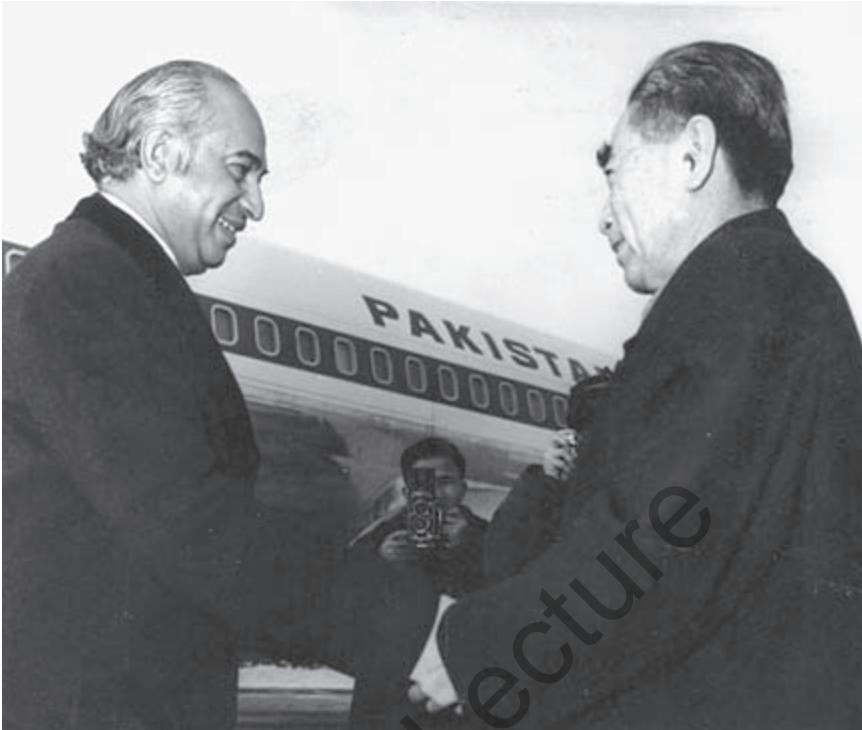
Chinese premier Chou-en-Lai receiving Zulfikar Ali Bhutto at Beijing Airport, late January 1972.

needed a gift from God, but Bhutto was willing to settle for some part of the soaring oil profits in Saudi Arabia, the Gulf States, and Iran. The Arabs and the Iranians had better places to invest than Pakistan. Promoting the export of manpower was the next best choice for the PPP government.