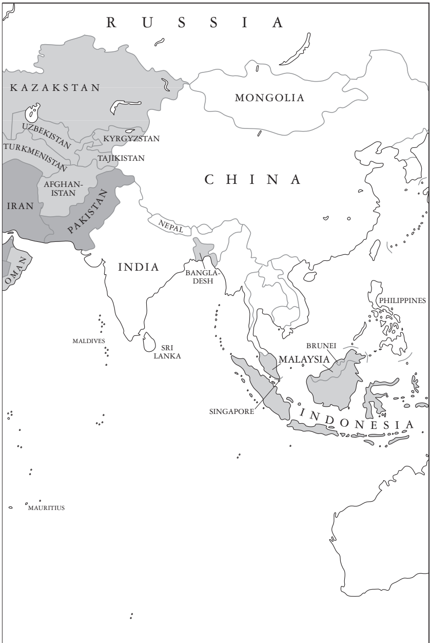
Map 2. (cont.)