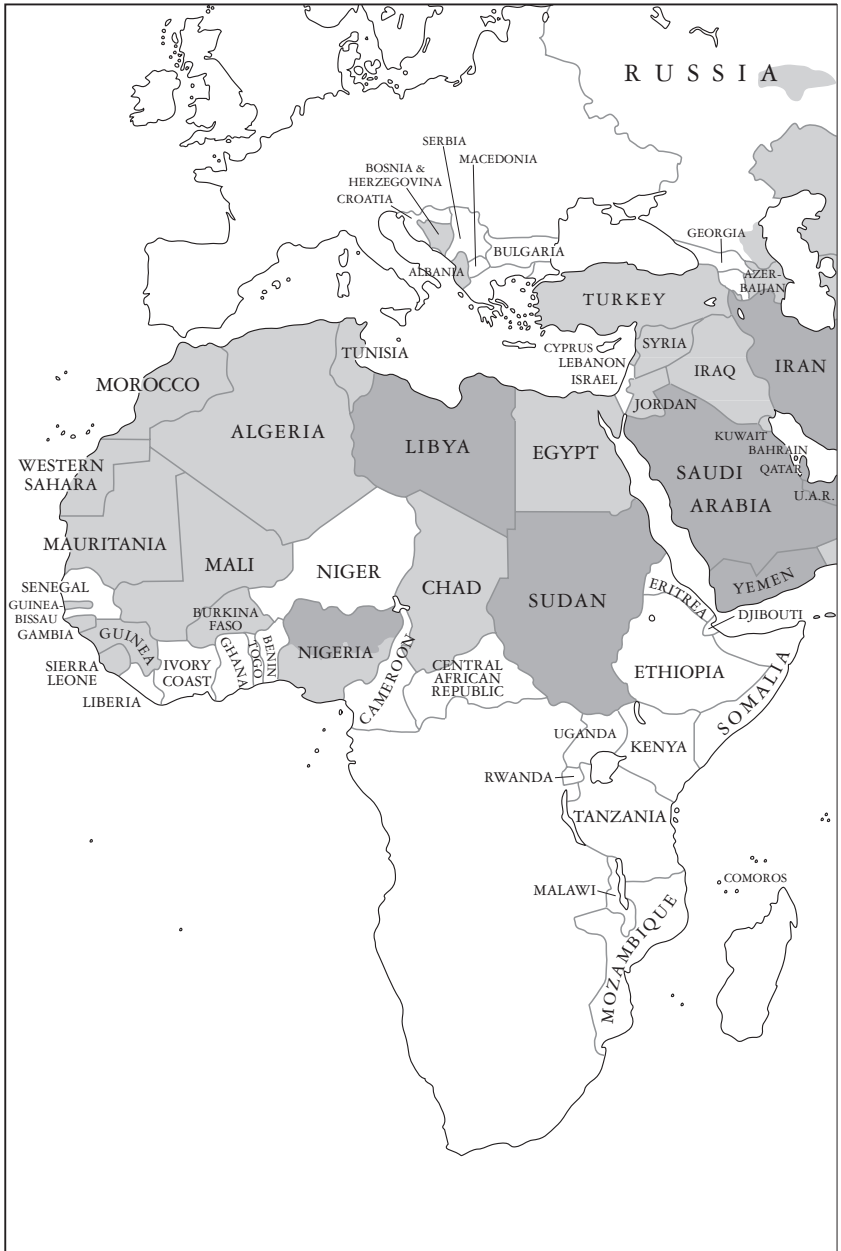
Map 2. Countries implementing Shari'a criminal law (dark grey)