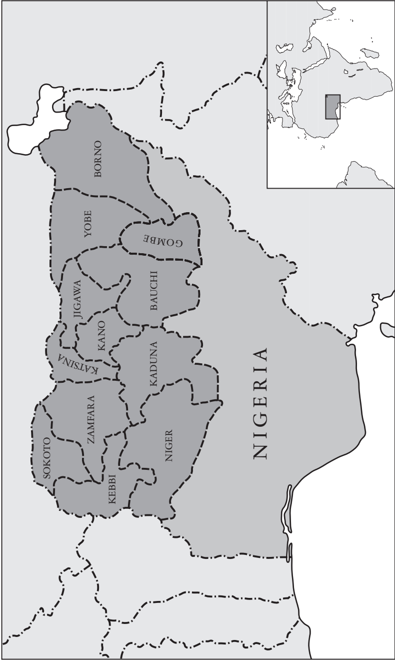
Map 3. The spread of Shari' criminal law in Nigeria (dark grey)